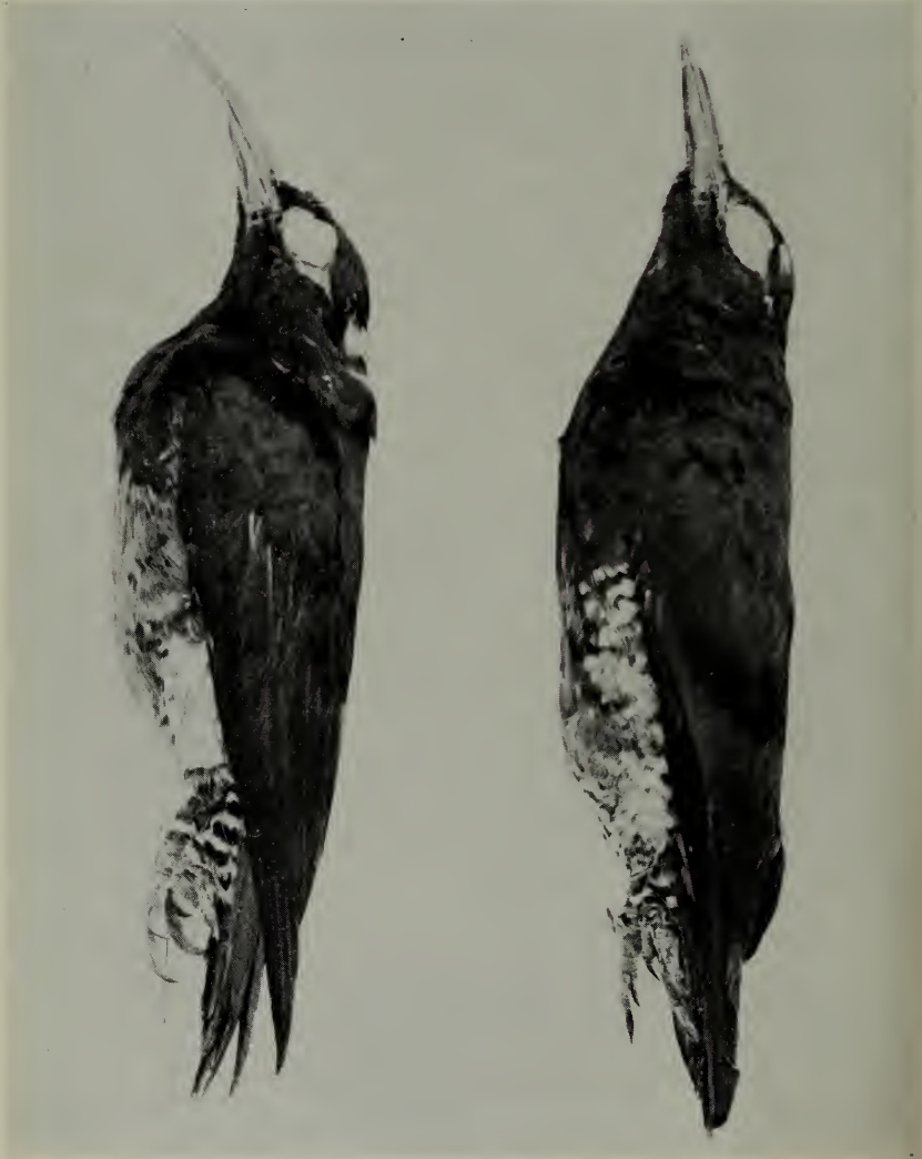
Left. A male Melanerpes cruentatus with a deformed bill Right. A specimen with a normal bill

The bird was in perfect plumage and condition and it was hammering with some others in the top of a dead tree. Apparently it was not handicapped at all by its lengthened upper mandible which seems strange for a bird so dependent on the use of its bill. The specimen is now preserved under my field number 5890 in the Leiden Museum.